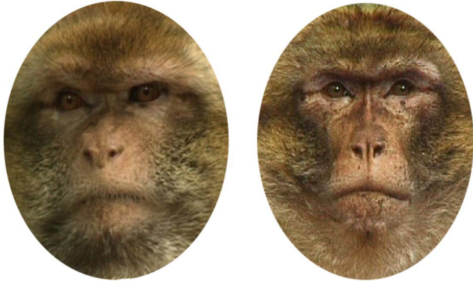
Figure 1: Example of Barbary macaque face pairing stimuli used in each experiment.